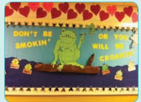
KCP partnered with ARH Cancer Center for an anti-smoking door decorating contest called "Kick Butts" with Roy G. Eversole Elementary in Hazard.

comparable to experimental schools in the previous study. Technical improvements were made to the ASPIRE website, assistance offered for integration into the school curriculum, and student incentives provided for participation. Focus groups and surveys were also conducted among teachers and students to assess cultural appropriateness. KCP will continue to work with M.D. Anderson to compile and report results and to offer ASPIRE in Kentucky schools into the next biennium.