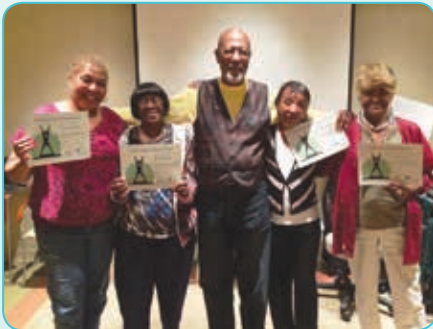
Proud graduates from the Cooper Clayton Method to Stop Smoking.