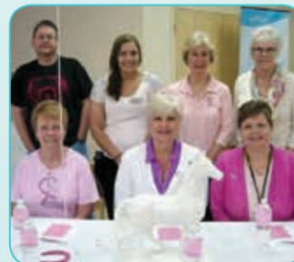
Special Horses and Hope Teas are held across the state for breast cancer awareness and education. Survivors also share their stories and words of encouragement. Pictured are members of the Fleming County Coalition and supporters.