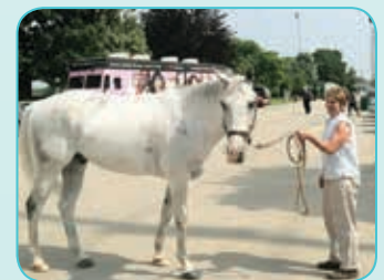
Mobile mammography units travel throughout the year to Kentucky's thoroughbred racetracks to provide breast cancer screening to horse industry workers, many of whom are uninsured. KCP bilingual outreach staff provide education and coordinate services.